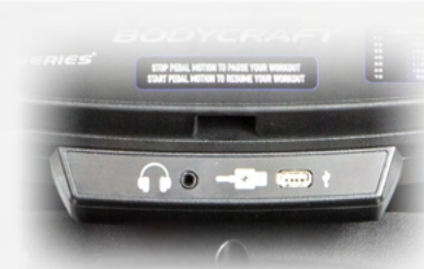
AUDIO JACK AND USB CHARGER (No Audio Jack on LCD Console)