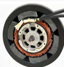
WHISPER QUIET PURE PRECISION COMMERCIAL GENERATOR BRAKE – LONGER LIFE