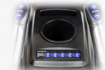
WATER BOTTLE HOLDER AND ACCESSORY TRAY WITH QUICK STRIDE KEYS