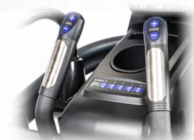
HEART RATE PULSE GRIPS WITH QUICK LEVEL KEYS AND STRIDE KEYS