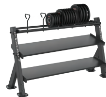
PLATE TRAY / BALL TRAY OPTION