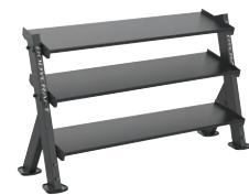
3 TRAY OPTION