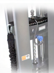
OPTIONAL SPEED TRAINER ATTACHMENT. PROVIDES SPEED TRAINING, PROGRESSIVE RESISTANCE.