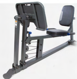
OPTIONAL LEG PRESS WITH TURBO FEATURE. YOU CHOOSE: 1:2 RATIO, OR 1:3 RATIO. UP TO 400 LBS