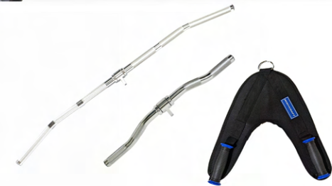
HIGH QUALITY ALUMINUM ACCESSORIES & BRANDED AB CRUNCH STRAP.