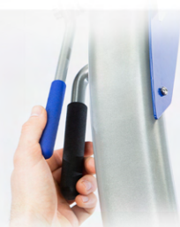
PRESS ARM ADJUSTMENT HANDLE. EASILY ADJUST FROM SEATED POSITION.