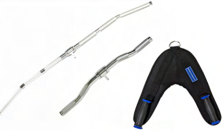
IGH QUALITY ALUMINUM ACCESSORIES & Branded ab Crunch Strap.