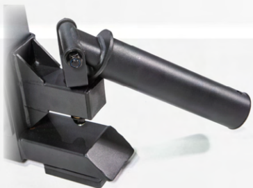
F737 LANDMINE ATTACHMENT