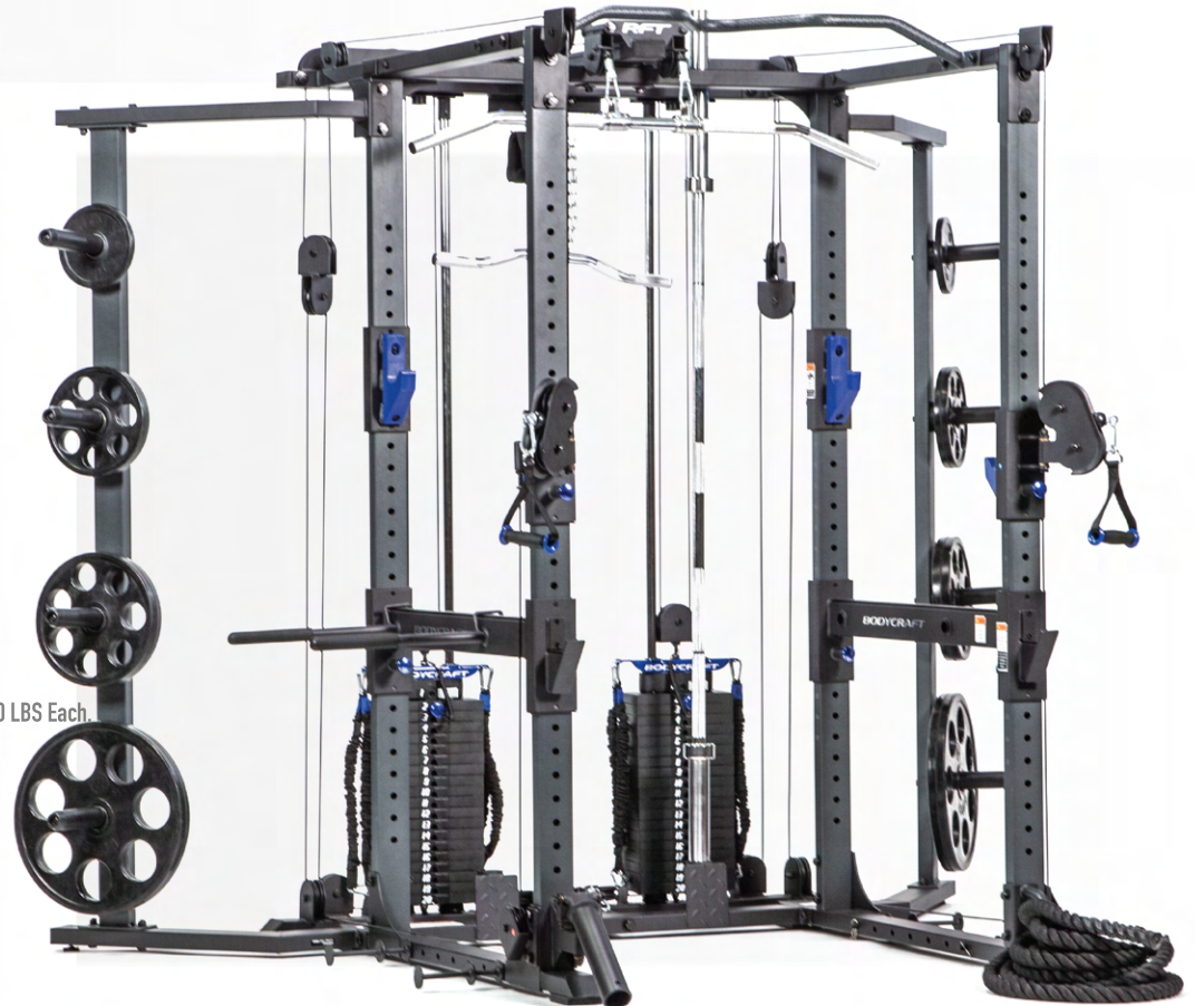
*SHOWN FULLY LOADED WITH ALL OPTIONAL ADD-ONS