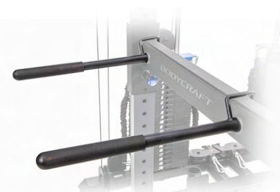
F732 DIP ATTACHMENT