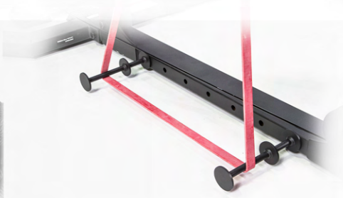
F734 BAND PEG ATTACHMENT