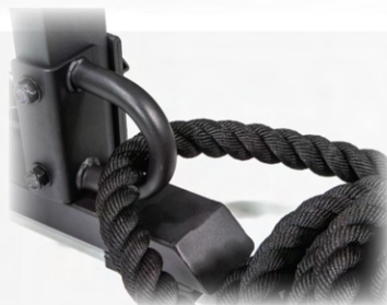
F739 BATTLE ROPE ATTACHMENT