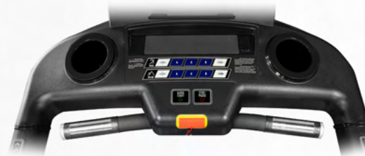
DUAL CUP / ACCESSORY HOLDERS, HAND PULSE GRIPS, QUICK KEYS, AND 4 CUSTOM KEYS