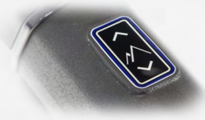
HANDLEBAR QUICK KEYS – SPEED AND INCLINE