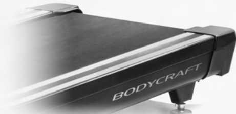
SOLID ALUMINUM SIDE STEP RAILS