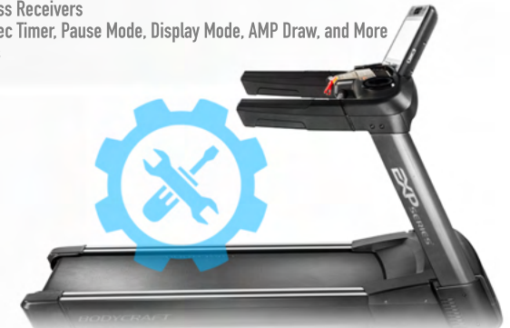
FULLY ASSEMBLED, 99 MINUTE RUN TEST, AND 21 POINT INSPECTION BEFORE SHIPPING