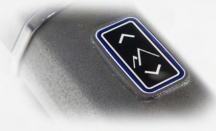
HANDLEBAR QUICK KEYS – SPEED AND INCLINE