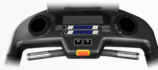
DUAL CUP / ACCESSORY HOLDERS, HAND PULSE GRIPS, QUICK KEYS, AND 4 CUSTOM KEYS