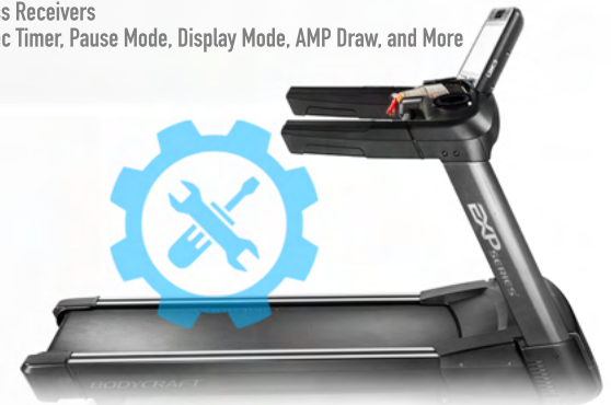
FULLY ASSEMBLED, 99 MINUTE RUN TEST, AND 21 POINT INSPECTION BEFORE SHIPPING