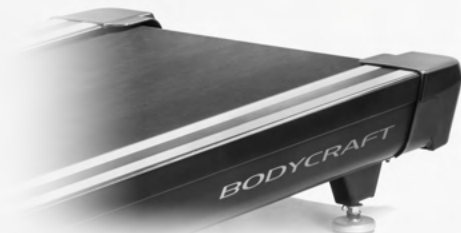
SOLID ALUMINUM SIDE STEP RAILS